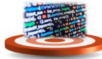
Phase 2 (Term 2) Programming