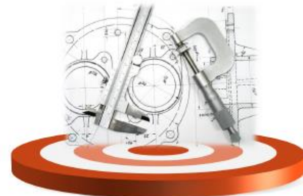
Phase 3 (Terms 3-4) Design and Create