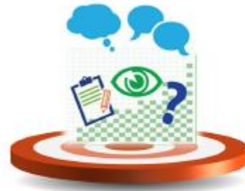
Phase 1 (Term 1) Scientific Research Thinking

Interdisciplinary cultivate students' perception of Science as a collective effort and a way of thinking rather than just a body of facts