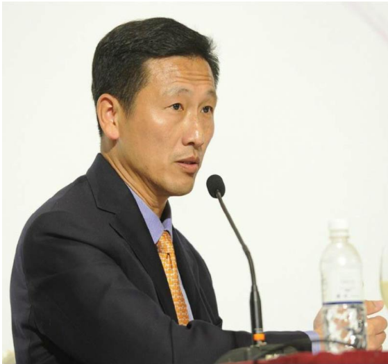
Mr Ong Ye Kung

Minister for Education (Higher Education & Skills)